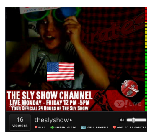
Figure 5. On The Sly Show, Sly often overlays text banners, a station bug (logo in the lower right side), and event graphics (the USA flag in this example).

Sly almost always has a text banner overlaid on his video and often adds other graphics and icons (Figure 5). He says "Consistency is the core key to success," so he tries to incorporate his video into a more 'professional' style with logo overlays as seen on broadcast TV. He believes the combination of show