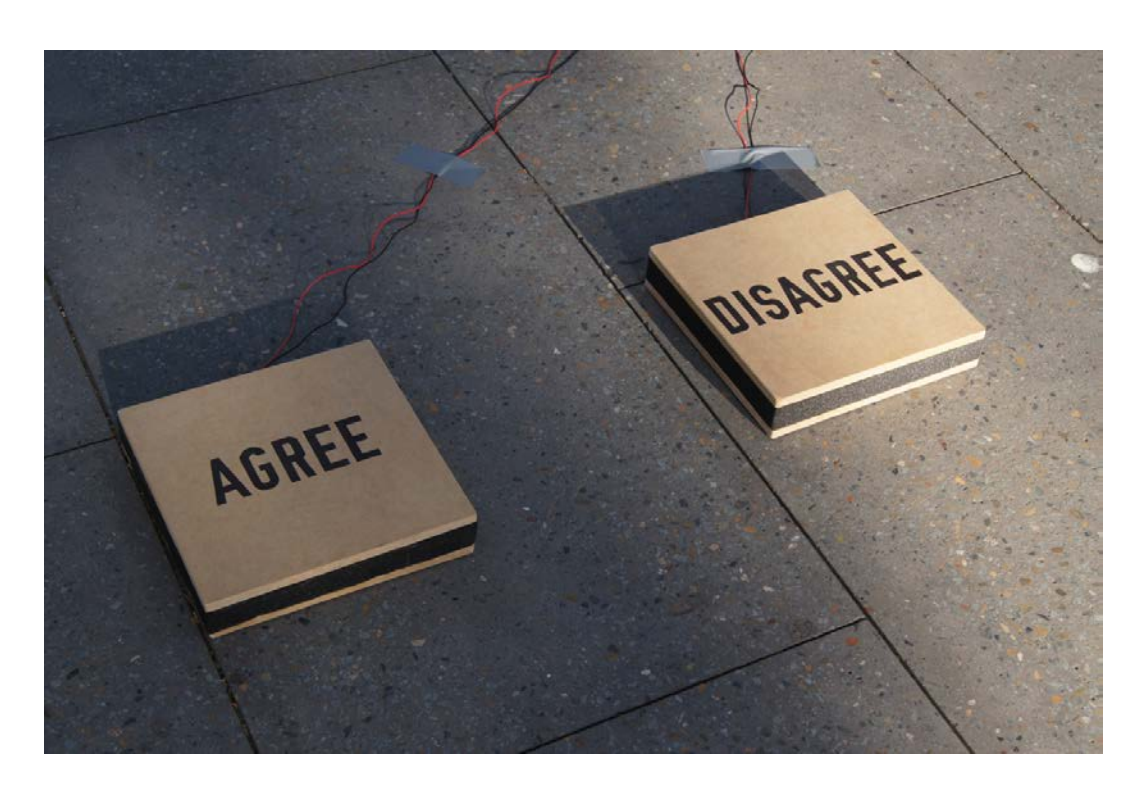
Figure 3: The AGREE and DISAGREE buttons