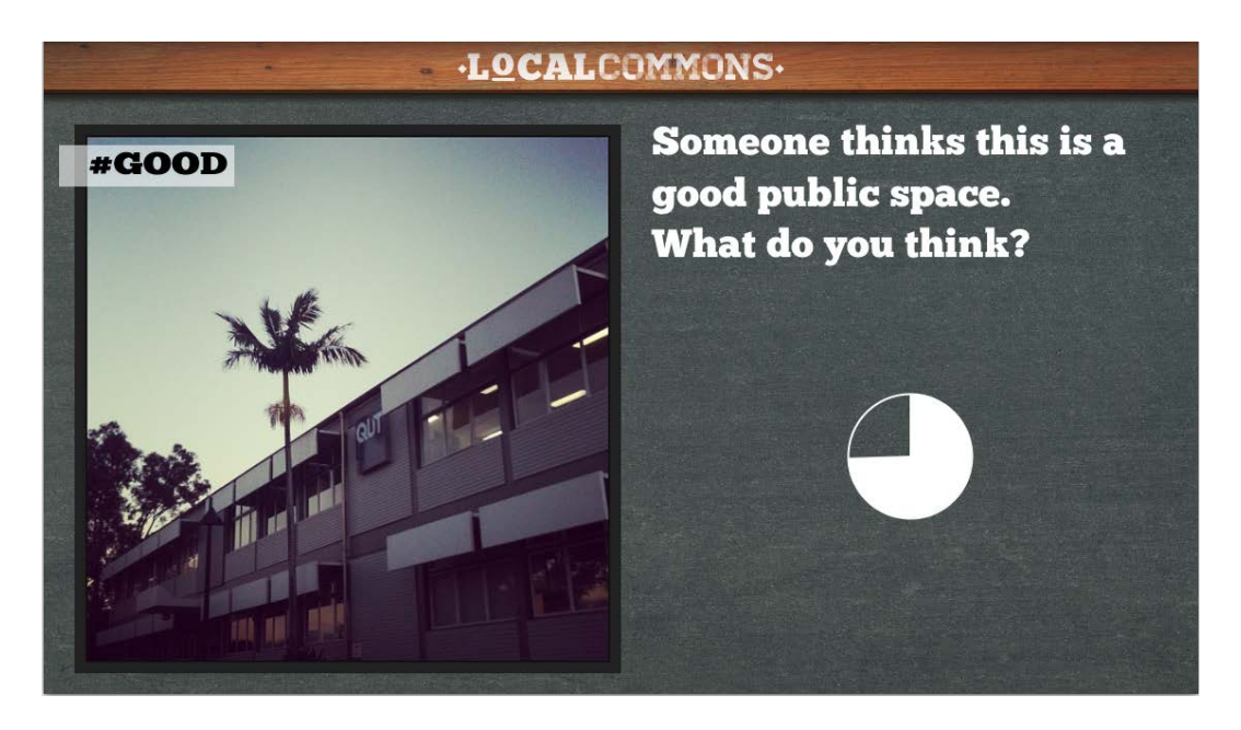
Figure 2: The main screen displaying an image tagged #good

The buttons (Figure 3) are made of wood and foam. They have a size of approximately 27 by 27 cm and a height of about 7 cm. Inside, we re-purposed off-the-shelf door bell buttons, which, connected to an Arduino, allowed us to detect button presses. For the visual input, we used the Instagram API. The interaction with Instagram was handled through the hashtags users can attach to their images. By using the Instagram API, all images tagged with a specific hashtag can be requested. In this case, the intervention queried Instagram for all images tagged with #LocalCommons. These images were then saved in an online database. Due to ethical restrictions, a moderation feature was added. After moderation, the accepted images were collected from the online database and saved in a local database that served them to the application for display.