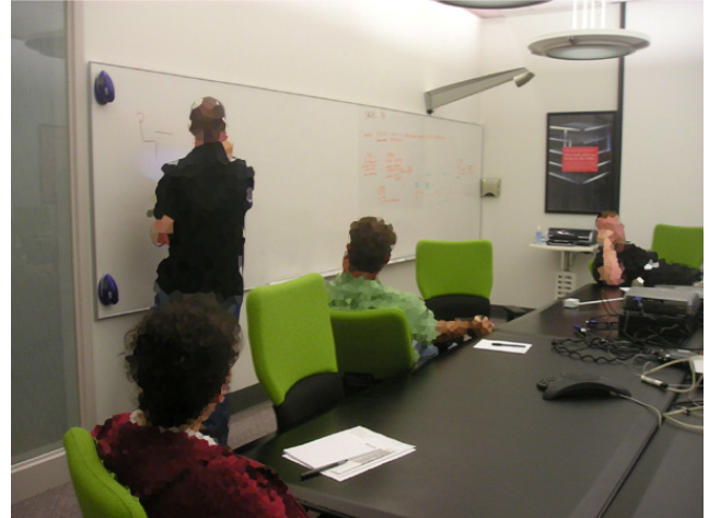
Figure 2. Conference room at Beta Corp.

However, in this study, we observed actual companies and their employees on a day-to-day basis, requiring a balancing of privacy and confidentiality. Because material discussed at meetings could have proprietary information, several individuals expressed concern about using a continual video observation of the spaces. Furthermore, research by Hayes showed that users were reluctant to enter a space under continual surveillance, even if they had the ability to “purge” the video capture [8].