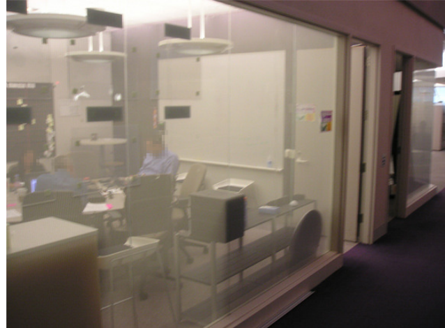
Figure 1. Project room at Alpha Corp.

managers, product buyers, product suppliers, and account management.