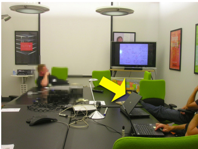
Figure 4. A laptop partially closed during a meeting in the conference room at Beta Corp.

Whiteboards: In both the conference and project rooms, the whiteboards were used with regular frequency, approximately 34% and 40% respectively. Whiteboards were frequently used for short sketches, scheduling, and brainstorming activities in both spaces. In one meeting in the conference room at Beta Corp., participants placed Post-It notes on the board during a brainstorming activity and used markers to annotate concepts.